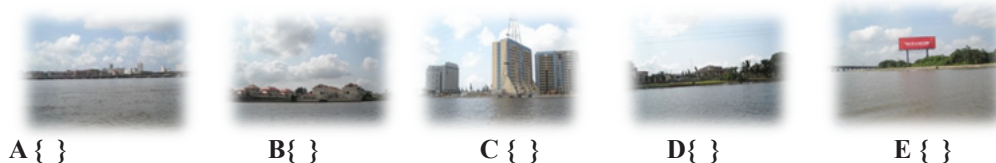
Figure 4.2 Totally Urban Pictures