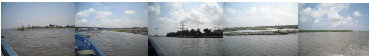
K { } L { } M { } N { } O { }

In the second set of pictures (Figure 4.3) comprising shots of different landscape elements of the lagoon, results show that they were considered beautiful except for picture J which had a score of 2.9.