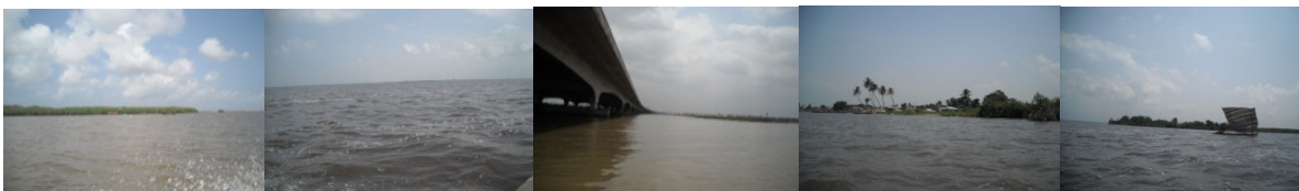
F { } G { } H { } I { } J { }