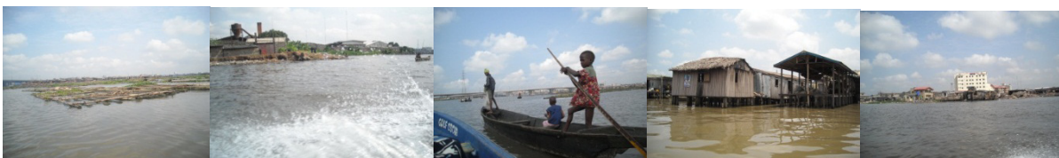
P { } Q { } R { } S { } T { }

and picture M (showing mixed vegetation) which jointly had the lowest score of 58, as the least liked pictures in the group.