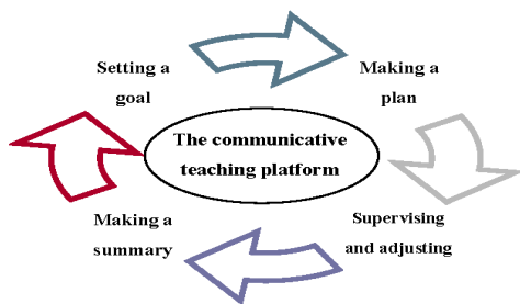
Figure 2 The specific application of Metacognitive Strategies

how to learn independently. In addition to making plans and decisions on their own, students also need to find the problems, analyze the problems, and solve the problems when they are learning the second language. Finally, they should combine the evaluation given by teacher and classmates with their own reflection on their performance, and review what they have learned. The whole process of learning when students study initiatively and actively according to their interest and ability basically reflects the key concepts of Metacognitive Strategies put forward by O'Malley and Chamot, that is, "selective attention", "advance organizers", "directed attention", "self-management", "advance preparation", "self-monitoring", "delayed production" and "self-evaluation". The specific application of Metacognitive Strategies is illustrated by Figure 2.