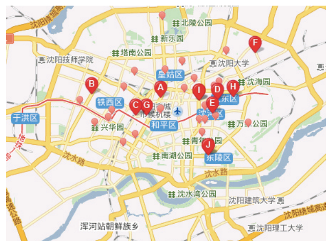
Figure 1 The Distribution of Home Inns Budget Hotels in Shenyang

Since 2006 when the first Home Inns budget hotel was located in Shenyang, Home Inns has already opened 25 branches with a speed of five hotels per year in average. The expansion is continuing. However, there are many hidden problems with such a rapid development. For example, its Jinqiao Road hotel, the Forbidden City hotel, Zhongjie Hotel, and Taiqing Palace hotel are located so closely that you can approach any of them within one or two bus stops. As shown in Figure 1, the Forbidden City hotel, Zhongjie Hotel, and Taiqing Palace hotel are located around E point.