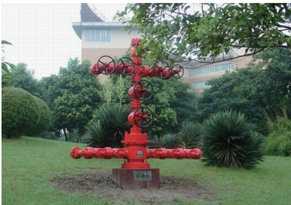
Figure 4 Oil or Gas Wells' Christmas Tree

Beam pumping unit as a sort of the oldest and most widely used type of oil production equipment in the oilfield, is reliable, solid and easy to maintain. Presently, the beam pumping unit has been developed in various models based on conventional types.