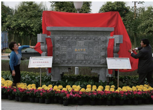
Figure 5 The "Cuiying Tripod" Donated by Schoolfellow of Oilfield Chemistry Major

Figure 5 displays the "Cuiying tripod" donated by schoolfellow of Oilfield Chemistry major. Figure 6 shows the landscape stone designed by graduates of the Architectural Engineering Institute, where the latitude and longitude and the elevation of the school are caved. By the way, the data on the stone is accurately obtained by the students' professional knowledge of surveying and mapping. Campus landscape sculpture and landscape stone not only beautify the campus environment and inherit the campus culture, but also provide a positive opportunity for the graduates expressing their gratitude to the alma mater.