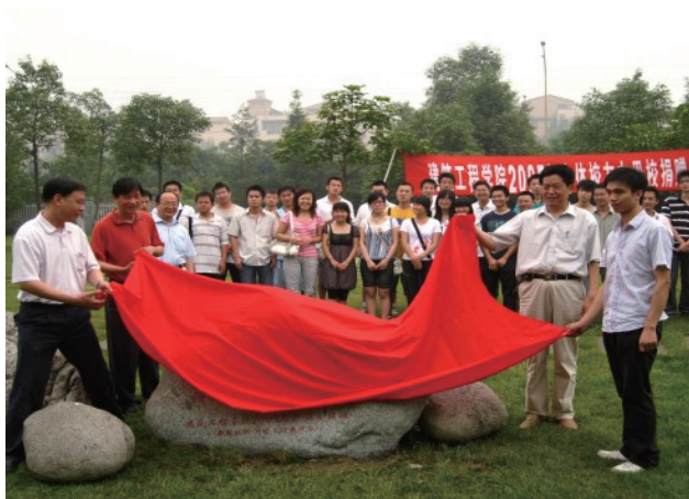
Figure 6 The Landscape Stone Designed by Graduates of the Architectural Engineering Institute