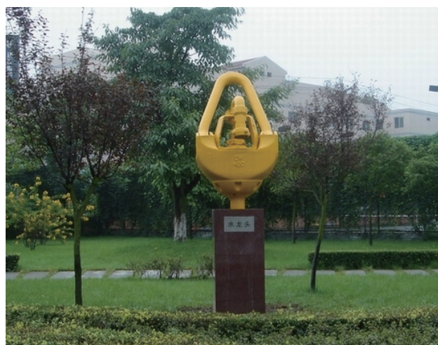
Figure 1 Drilling Faucet

Southwest Petroleum University is the second petroleum university created by P. R. China. It is a petroleum professional-based and highly professional college with a prominent feature of the oil and natural gas. The teachers of the university are mainly from the oil fields or oil professional universities, and the graduates will devote themselves to the domestic and international petroleum system. Based on the cultural characteristics, the university creates an economical campus decorated by some oil machinery equipments during the design and planning of campus landscapes. To be specially mentioned, the equipments are disused that are provided by Chuanqing Drilling Engineering Co., Ltd. as well as Oil and Gas Field Southwest Branch of CNPC. The devices are placed in the green area of the campus after repainting, just like three-dimensional, colorful and attractive textbooks, and they will be as cultural symbols permanently displayed in the college. Figure 1, Figure 2, Figure 3 and Figure 4 show the various cultural campus landscapes distributed in the Southwest Petroleum University.