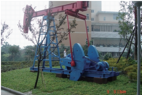
Figure 3 Beam Pumping Unit

Roller shaft is one part of the drilling winch which is the executive component in the lifting system, as well as the core component of the entire rig.