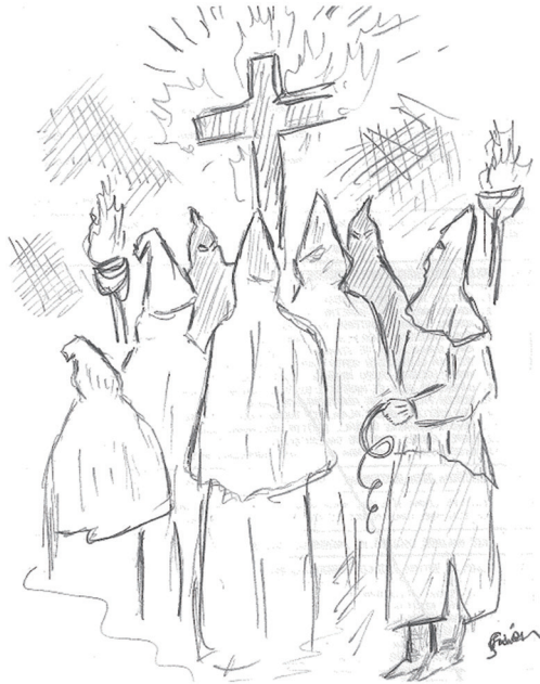
Figure 2 The Klanists on the Verge of Action (Illustration by the Author—S.C.)