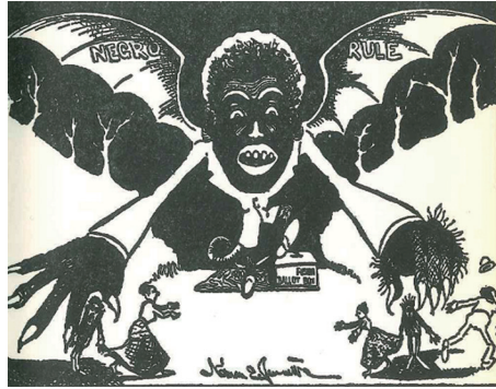
Figure 4 A Cartoon in a Publication in North Carolina in 1900: An Exaggerated Fear of a Possible (!) Black Rule! (From the Book of Randel, 1965)