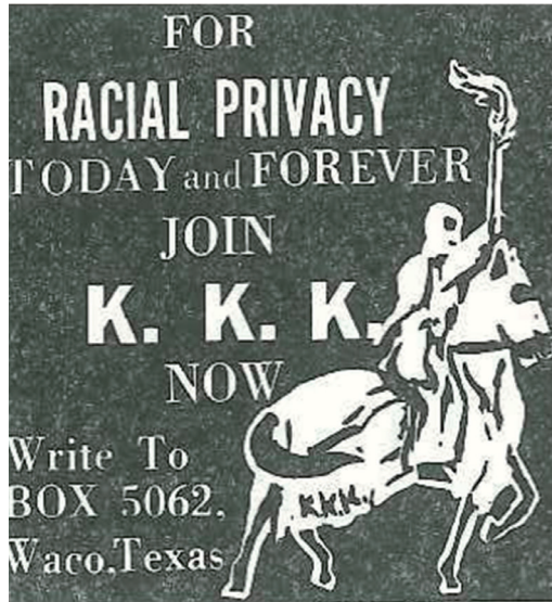
Figure 6 A Member-Recruitment Invitation Printed in Paper, in Former Times (From the Book of Randel, 1965)