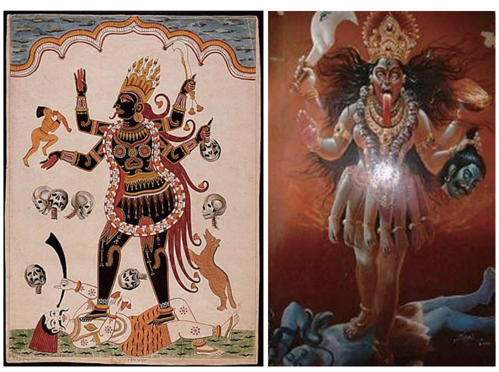
Figure 1 Depictions of Kâli