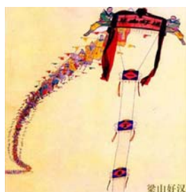
Fig 3: Liangshan heroes Weifang kite

Weifang kites rolled easily. It only takes three bamboos to make a flying Chunyan (spring swallow). One line is preferred in the contour. The attitude of making kites is precise, for if the kite is asymmetric it is difficult to fly to the sky and even it does fly and it will stagger to fly down. Therefore those asymmetric-shaped kites will have to be consistent in weight. Weifang kites representative works are shown in Figure 3, Figure 4.