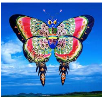
Fig 5: Tianjin kite (butterfly)

Tianjin kites are rich in color and local flavor. Tianjin kites representative works are shown in Figure5, Figure 6.