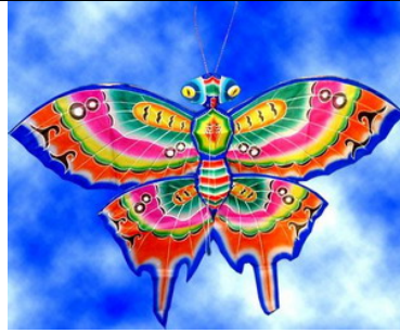
Fig 12: Taiwan kite (butterfly)