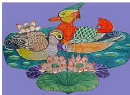
Fig 6: Tianjin kite (yuanyang )