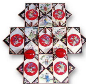
Fig 8: Nantong kite