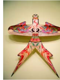
Fig 2: Beijing kite (thin)