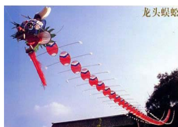
Fig 4: Dragon head kite