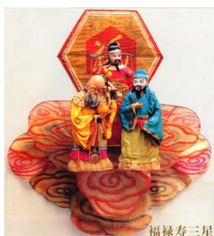
Fig 7: Happiness, social status, longevity

The other one is in Nantong city & county, represented by the "kite" kite (commonly known as "board gull"). For a long time, it does not attach importance to refined scholars, is not recorded in the annals of history and rich in rural ambience, with distinct local characteristics, is a local kite to the core. The artistic style of Nantong kites can be summarized as simple shapes, the whistling devices with the symphony in high and low pitches, and elegant fine brushwork painting. The basic styles of Nantong kites can be divided into two categories of "board Harrier" and the "live Harrier". The main features are exquisite production, simple style, and vivid colors. Harrier, integrating carving, bar, calligraphy, painting, embroidery and other craft into one exquisite workmanship, is not only of highly ornamental and collective value, but also performs beautiful and stable flying, and even whistles with a variety of tones to make an harmonious and rhythmic sound, which, like a fascinating beauty in the sky with an elegant voice and countenance, flies from heaven to earth enjoying a lot of fun between people and nature. Nantong kite masterpieces are seen in Figure 7, 8, 9.