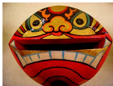
Fig 9: Whistle mouth