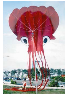
Fig 13: Taiwan kite

Chinese kite, as a special folk art, is related to painting, binding, natural science, folk customs, entertainment and many other aspects. Kite art, as a folklore symbol, achieves the harmonious integration of human, art, and nature. Up to now kite decorative arts combine traditional Chinese aesthetic consciousness with modern shaping element perfectly. Different art schools of kites enhance each other's beauty. Various artistic schools of kites have distinctive features and compete with each other for beauty, reflecting the various aesthetic characteristics of different regions and cultures and inheriting various local folklore cultures. In general, Beijing kite and Weifang kite are representatives of the Northern Kites, from decorative patterns to shaping, appearing vigorous, bold, colorful and strong. The kites in the South seem light, delicately beautiful, fresh in color, elegant, uniquely poetic. Lots of schools of kite art mix together and interact, which jointly form the splendid Chinese kite culture and art.