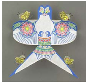
Fig 1: Beijing kite (fat)

The artistic shapes of Beijing kite generally have seven forms: bar swallow, hard wing, soft wing, couple, beat, strings, tube. Beijing kite has maintained an elaborate skeleton, rigorous painting, elegant, ornamental characteristics of high artistic value and style. Cao Xueqin's legacy was inherited by Beijing kite and traditional kite was decorated with Cao's design. Sand Martin kites mix human appearance with swallow, endlessly praise the beauty of life, vibrant color screen, changeable delicate brushwork, and depict the exaggerated and realistic image, at the same time pay attention to the beauty of the dynamic in the static, and adapt to the changeable and windy weather of the north with good stable release. The representative works Beijing kites are seen in Figure 1, Figure 2.