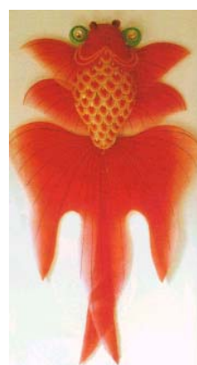
Fig 11: Jiangnan kite (golden fish)