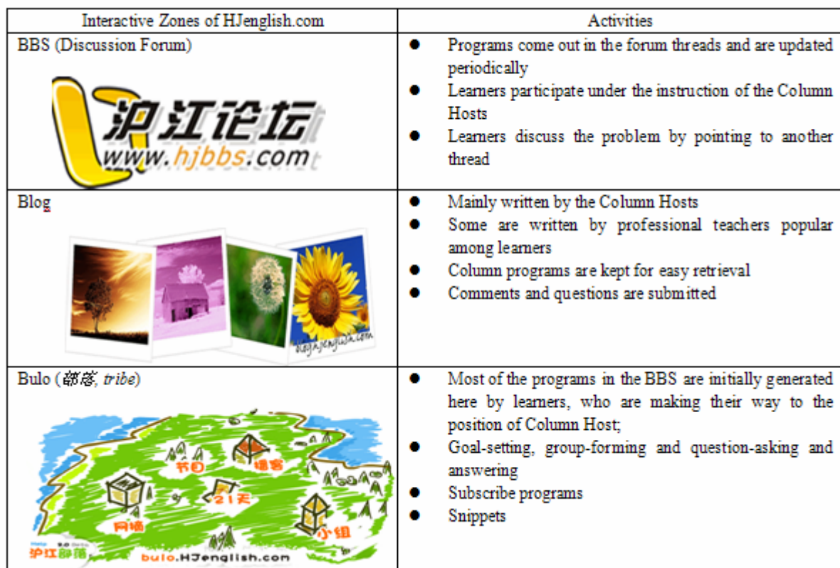
Table 2: Three Interactive Zones of HJenglish.com and Activities

Dudley, et al. (2001) mentioned that intrinsic motivation is associated with numerous aspects of the academic experience, where basic human needs for competence, autonomy, and relatedness are concerned. Intrinsically motivated activities are those that the learner engages in for their own sake because of their value, interest, and challenge. We think that the activities in this community are concerned with learners’ competence (singing contest), autonomy (goal-setting and schedule), and relatedness (Wish Wall). Their voluntary participation itself is an indicator of their interest and devotion. Learners outsource learning materials and comprehend the information before they present the knowledge they obtain from the information to other learners. We would like to put the process as this: sharing locally while exploiting global Internet store, generating locally useful materials but developing a global perspective (this may also be what the theme “Internationalization and Localization of CALL” wants to convey). Information is thus transformed into knowledge and learning quality is greatly enhanced during these activities and social interaction.