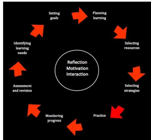
Figure 1 The Iterative Self-directed Learning Process

teachers will be involved in the process of building up the self-directed learning during which they are interplayed with each other to foster their reflection, motivation and interaction in order to enhance the ability of autonomy. They are widely considered to be the key skills learners need to be able to self-direct their learning. We will focus on the more practical skills involved in the development of autonomy of both learners and teachers.