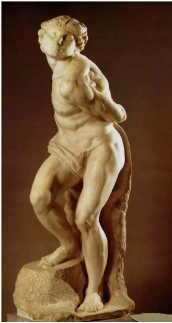
Figure 1 Rebellious Slave by Michelangelo

a powerful language, which conveys his ideology to the audiences far beyond their visual perception.