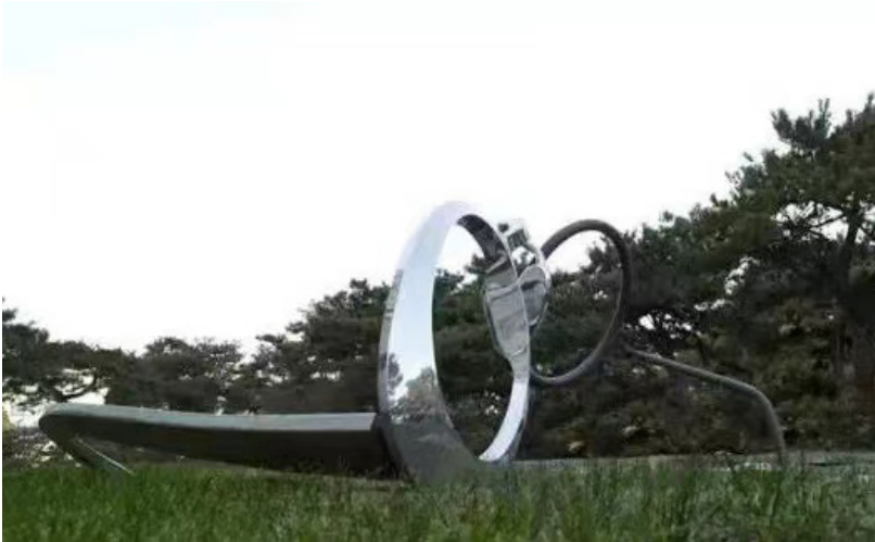
Figure 3 Two Sides of the Glasses by sculptor Xu Zhenglong (Made in copper and stainless steel)