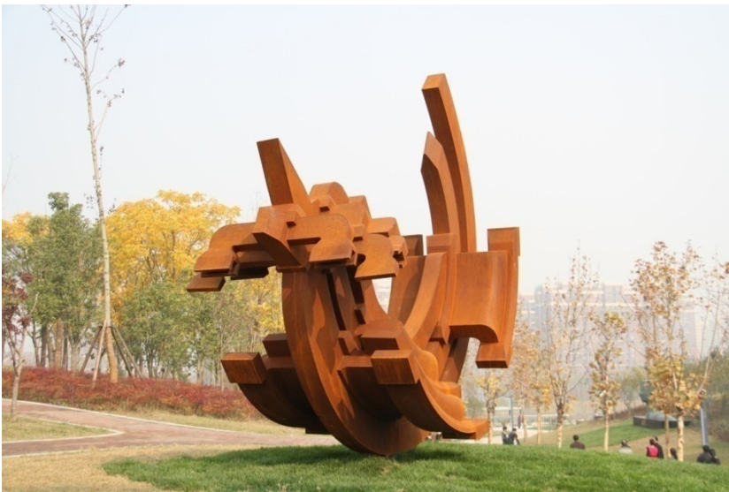
Figure 4 Newspaper-Yang by young artist Liang Jiachao (Made in copper and stainless steel)

Negative space surrounds the positive space of sculptures and connects the surrounding environment and the sculpture to form one entity, which increases the spatial sense and enhances the charm of the sculpture. Negative space can exude unexpected expanding and adsorbing force. It can absorb the surrounding environment and incorporate them into the sculpture. This kind of accommodation of sculpture offers infinite possibilities, providing audience unlimited imagination. There are many pieces of art that use negative space in ancient China, such as the empty space in panes of ancient garden buildings. People can see different scenery through these panes when looking in different directions in various seasons. The beauty of negative space is creating vitality for changes. Negative space offers a unique sense of mystery. People are always curious about things that are