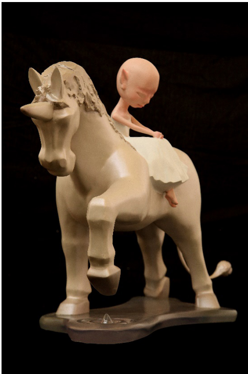
Figure 5 Dream as A Horse by Li Ying

when viewing the sculptures. Good sculptures always leave plenty room for imagination. Brilliant creativity always avoids showing everything directly and pursues uniqueness and endless aftertastes. For example, my previous work Dream as A Horse (Figure 5) shows a girl sitting on top of a horse moving forward. However, the real meaning of the sculpture is the reflection and thoughts on growing up. The sculpture is surrounded by a faintly gloomy atmosphere. The dreamlike coloring gives