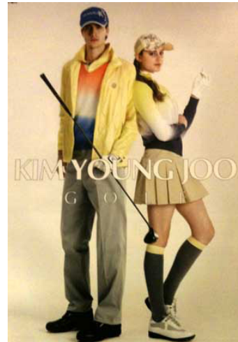
Figure 3 Kim Young Joo Golf, 2009-2010 F/W Collection

Golf wear in Korea has been largely influenced by western elements from the start. The first Korean golf players imitated the golf wear looks of foreign players they saw play the sport, and the introduction of foreign brands and seeing foreign players play at tournaments influenced their eye for golf fashion, too. However, Koreans, who tend to have a conservative nature, still have distinct characteristics such as a preference of neutral or basic colors, a preference for functional items and styles that can express individuality yet are not too different from other people. Korean golfers like to dress smart, but with this basis, clothing styles have grown more casual, youthful and diverse over the years.