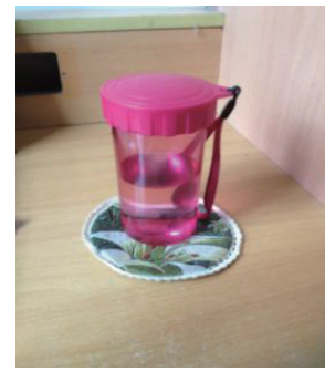
Figure 15 A Cup Mat of Color Weave Fabrics