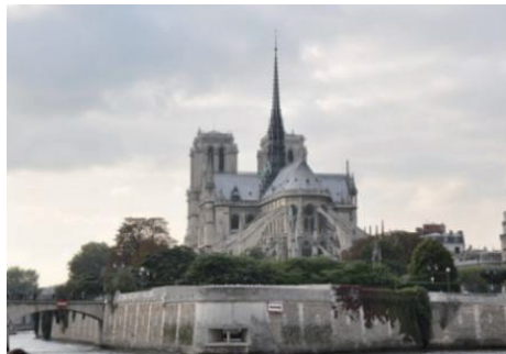
Figure 11 Notre-Dame De Paris

pillow. New patterns are added in meaning and expression of decoration. The grey-white image expression draws the outline of French style of the Notre Dame DE Paris. The mottled tree shadows, sights by the Seine River, flowing clouds, wherries, grey white color exhales nostalgic glows. The embroidery demonstrates the charm of oil painting and shows a distinctive flavor. When users hold the cotton pillow as if they themselves are in Paris, this kind of household items make customers feel natural scenery and traditional history and culture of France.