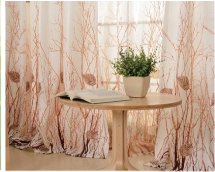
Figure 10 The Integration of Real Scenery Derivative Pattern and Curtains

Household cloth art and real scenery derivative pattern: real scenery derivative pattern can be used in the design of any home textiles, such as sofa fabric, cup mat, tablecloths, back cushion fabric, etc.. Although these tiny household cloth occupies not largely in the whole decoration environment, these tiny styles still play an important role in the household environment. Home textile pattern design must collocate with the whole indoor environment. Figure 11 is a photo of “Notre Dame DE Paris”. Figure 12 shows applications of the real scenery on