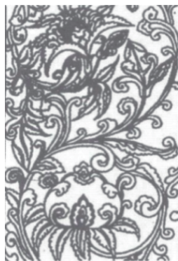
Figure 5 Scroll Design

Creation and application of Real scenery derivative pattern in home textile and its artistic style and expression