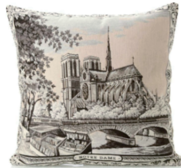
Figure 12 The Integration of Real Scenery Derivative Pattern and Pillows