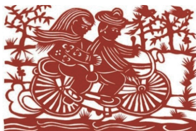
Figure 4 The Derived Pattern From Paper-Cut

Scenery patterns have various forms of performance techniques, all the real scenery textures can be expressed by different skin texture, as shown in Figures 2-3, oil painting method is used to express fine, soft or impact of real scenery in pattern design.