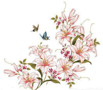
Figure 2 The Derived Pattern From Real Flowers