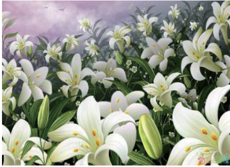
Figure 13 Lily