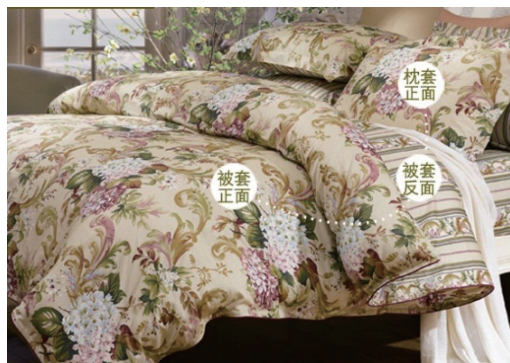
Figure 7 The Integration of Real Scenery Derivative Pattern and Bedding

Curtain pattern design and real scenery derivative pattern: Curtain is indispensable in household life. Curtain is one of the important parts of the sitting room and bedroom design. It has the function of protecting privacy, keeping out the light, attracting and reducing noise. In modern life, the curtain also has played a role of decoration and partition. The pattern design of curtain determines the aesthetic of the whole household, so the design of the curtain is colorful. Figure 8 is the autumn