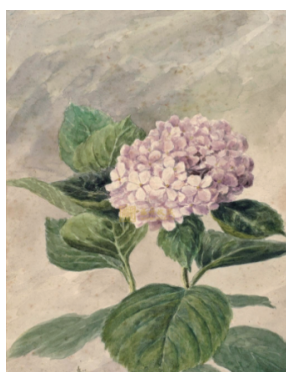
Figure 6 Hydrangea