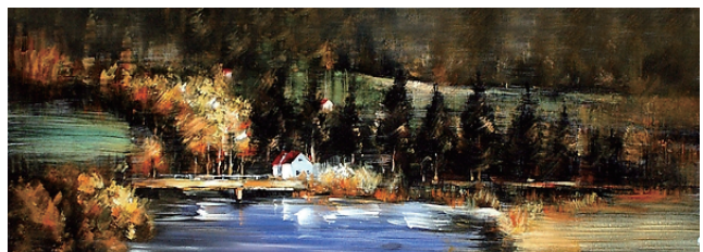
Figure 3 The Derived Pattern From Scenery