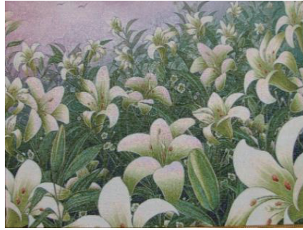
Figure 14 Color Weave