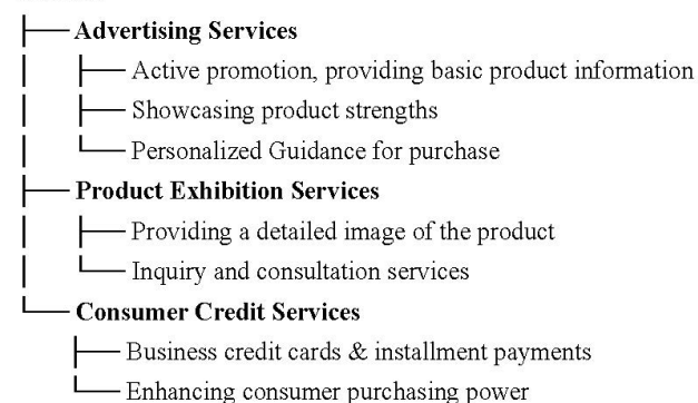
Figure 1 Digital intelligent Pre-sale marketing of Jingchu Unique ICH creative products