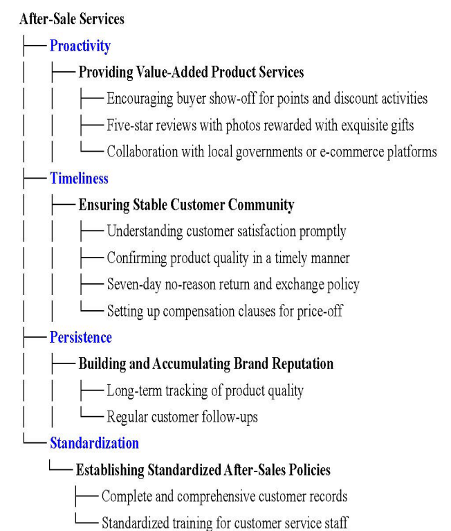
Figure 3 Digital intelligent after-sale marketing of Jingchu unique ICH creative products

Digital intelligence marketing strategies for after-sales services are crucial to enhancing the brand image and customer satisfaction of cultural and creative products with Jingchu ICH characteristics. Firstly, proactive strategies include providing value-added services, such as offering customized framing services for purchasers of the "Three Visits to Zhuge" woodblock prints. At the same time, customers are encouraged to share their positive experiences through buyers' shows to gather points and get discounts and five-star reviews to get gifts, thus customer engagement and loyalty to the brand produce will be enhanced.