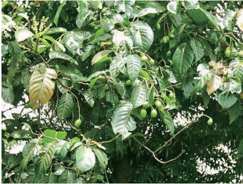
Figure 1 Terminalia chebula (Retz) ( SamaoThai )