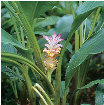
Figure 2 Curcuma zedoaria ( Berg) Rosco. ( Kamin Aoi) URL http://blog.naver.com