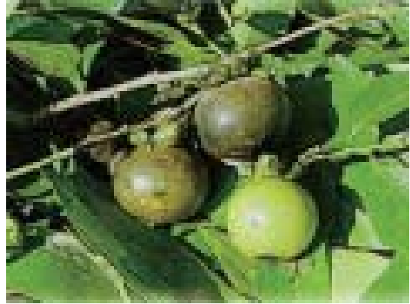
Figure 4 Diospyros mollis (Griff.) (Ebony tree) URL http://www.biogang.net/biodiversity_view.php?menu=biodiversity&uid=898&id=3524