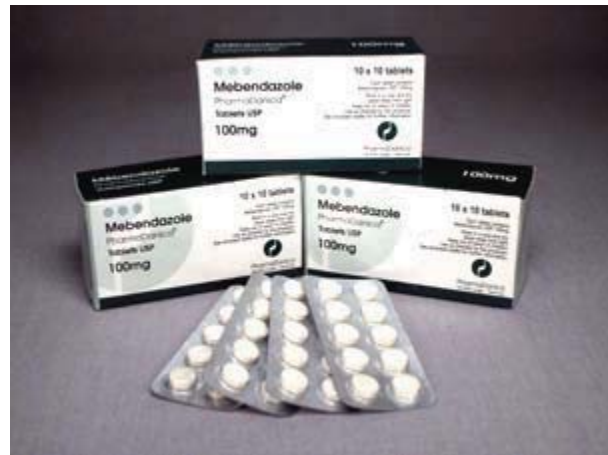
Figure 5 Mebendazole URL http://www.stanford.edu/class/humbio103/Parasites2006/Enterobius/